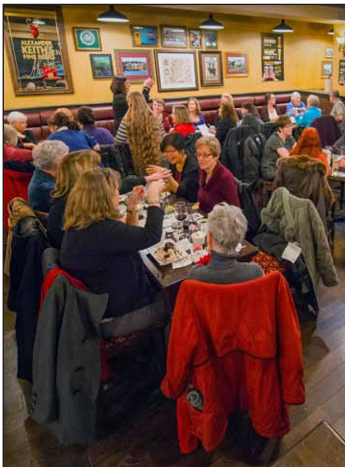
Celebrating a very successful Arteast year!