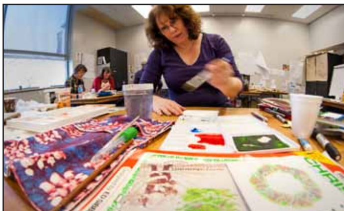
Studio at St. Laurent offers space to create