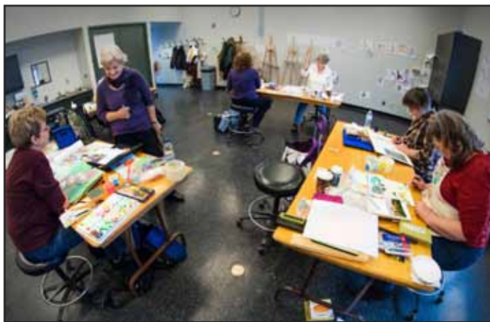
Studio time artists mingle and observe each others work in progress

Plans are now underway for more studio time starting in January 2014. Perhaps we will see you there?