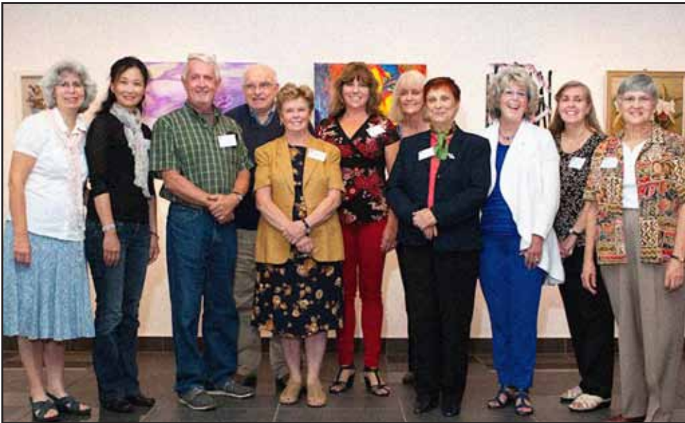
Proud exhibitors at the vernissage