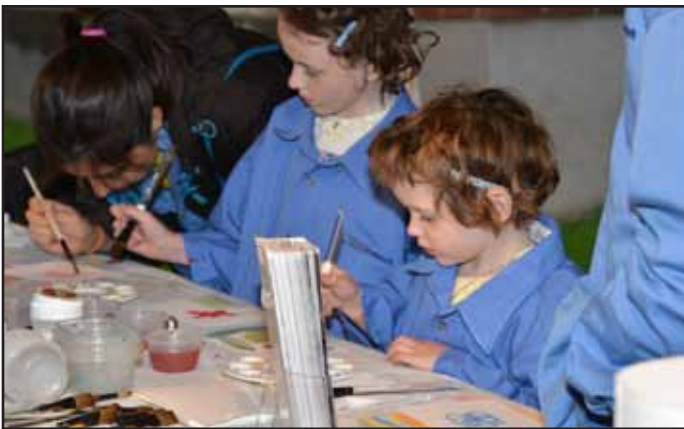
Children create cards using watercolour