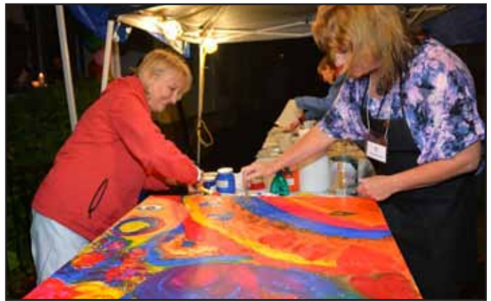
finishing touches made on children's art project